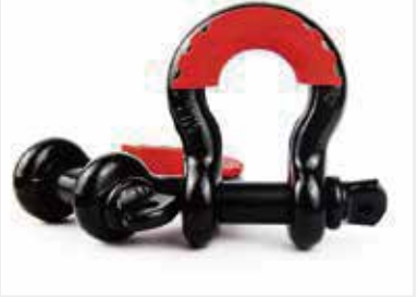
3/4" D Ring Shackle