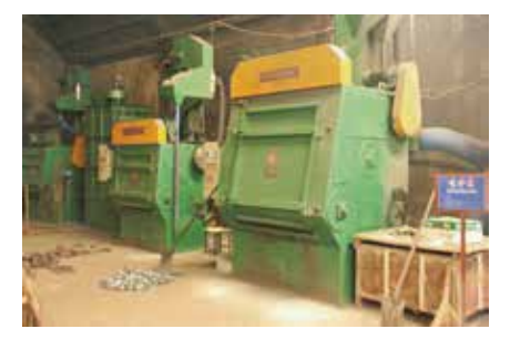
Shot Blasting Machine