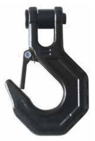
Custom Winch Hook