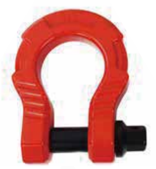
10T Suqare Mega Shackle+ Anti-theft pin