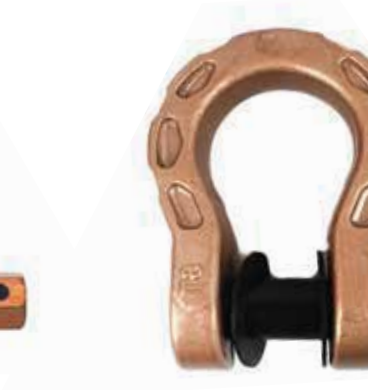
8T Mega Bow Shackle