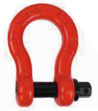
10T Round Mega Shackle+ Anti-theft pin