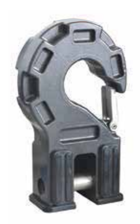
Aluminum Winch Hook